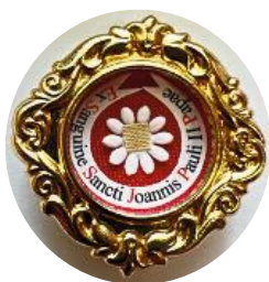
Pope St. John Paul II