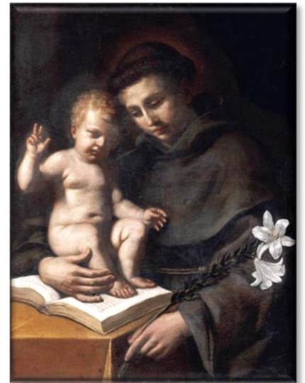
St. Anthony of Padua with the Infant Christ. Guercino, 1656