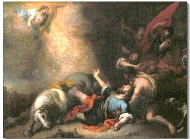
Conversion of St. Paul, Bartolome Esteban Murillo, 1675-1682.