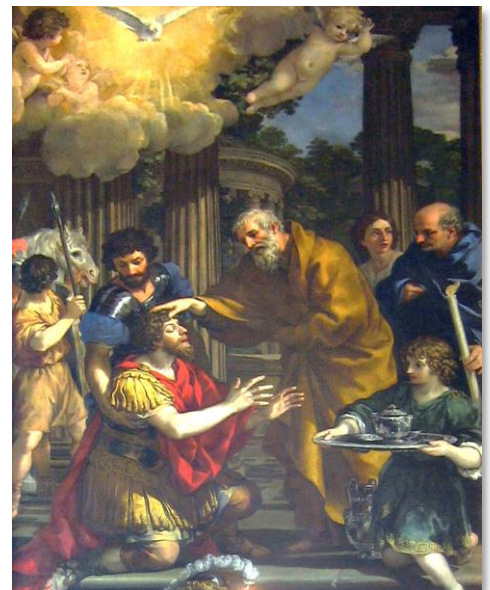
Ananias Restoring the Sight of St. Paul, Pietro da Cortona c.1631.