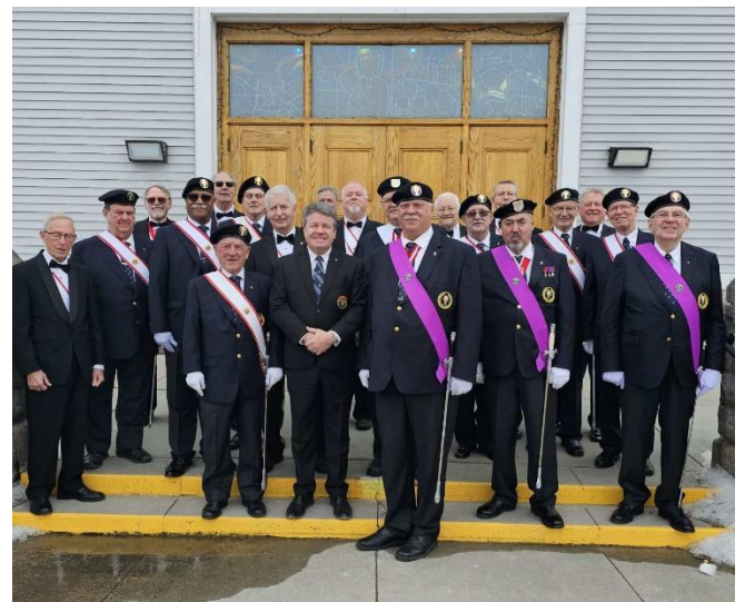
Divine Infant Parish Jan 29