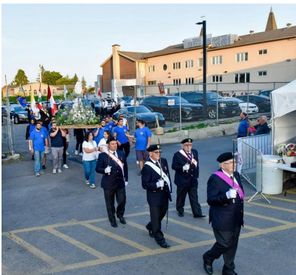
St Charbel Maronite Parish - August 9th

A successful solution for limited availability of Honour Guard participants.