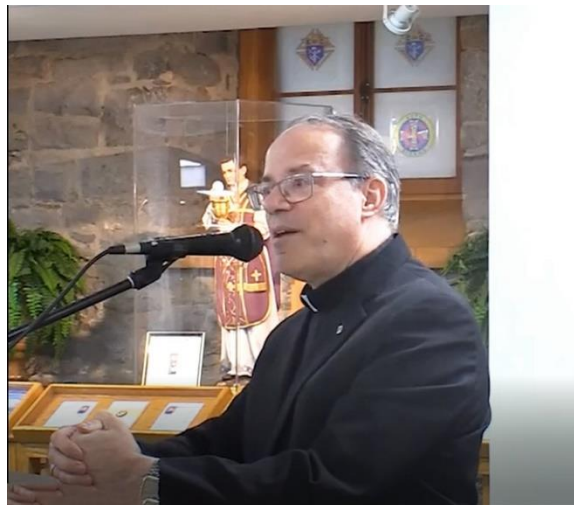
Marcel Damphousse - Archbishop Ottawa-Cornwall