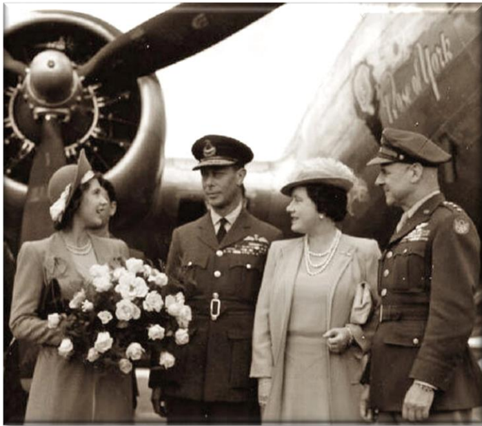
Princess Elizabeth, King George VI, Queen Elizabeth, and USAAF Lieutenant General Jimmy Doolittle. Princess Elizabeth is holding a large bouquet of "White Roses of York.". The King and Queen were known to fondly refer to their daughter, Princess Elizabeth, as their "Rose of York."

Since her death, tributes have been pouring in for Her Majesty Queen Elizabeth II. Well deserved, indeed!! Her place in history is clearly defined and, rightly so! Such a