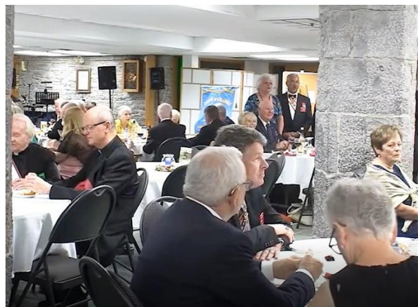
Table service imminent