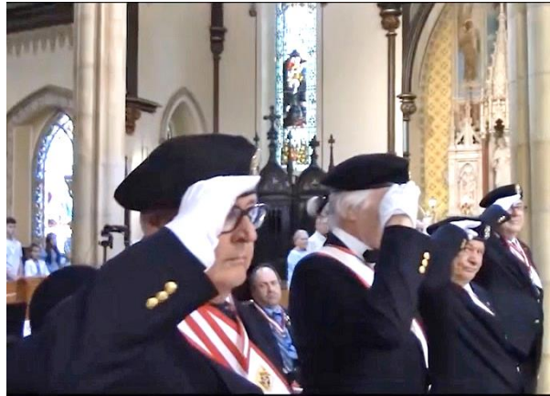
Honour Guard Saluting