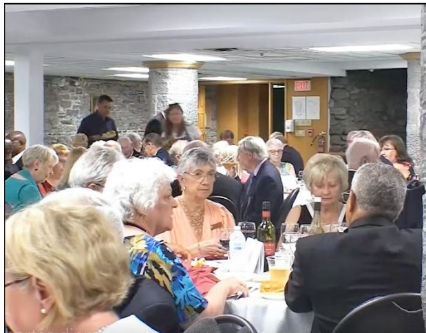
Guests happily socializing