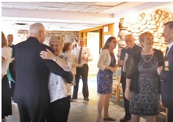
May I have the Last Waltz with You?