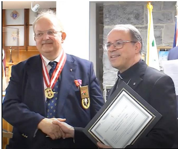
Presentation to Archbishop Damphousse