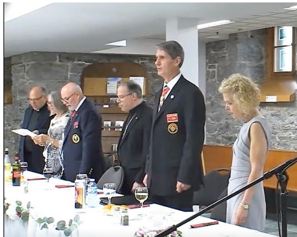
Introducing the Head Table