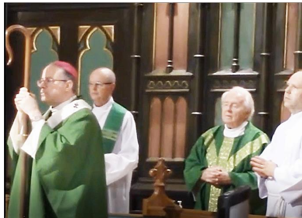
Listening to the Gospel