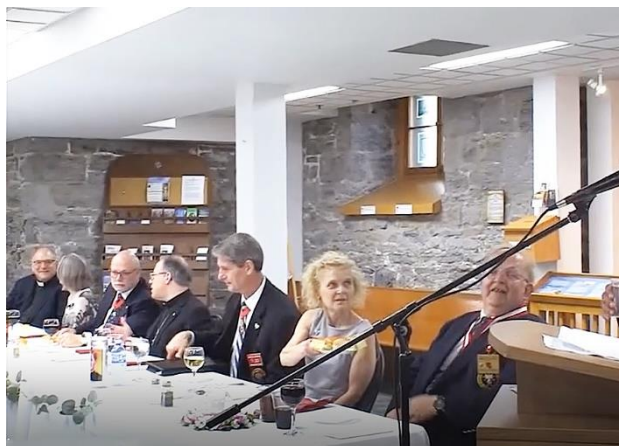
Service begins at the Head Table