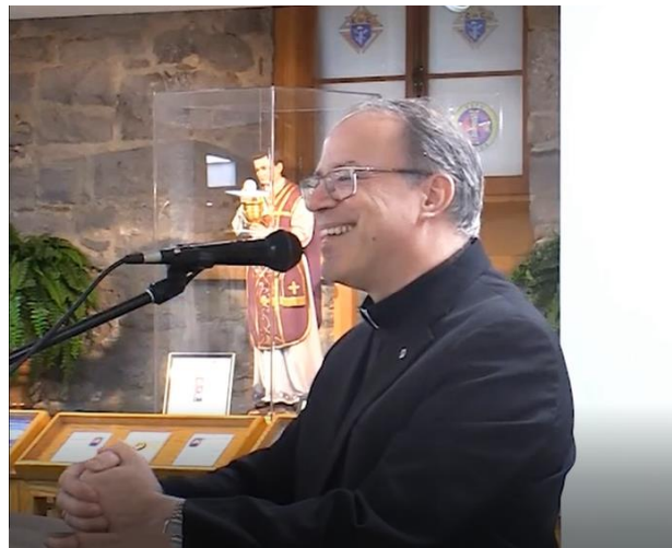
Archbishop Damphousse fields a question