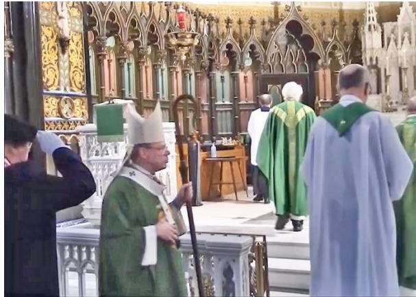
Celebrant - Archbishop Damphousse

(Images extracted from the Charter Dinner video. To view see https://adilo.bigcommand.com/watch/mC8cc2t8 )